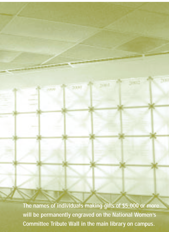
The names of individuals making gifts of $5,000 or more will be permanently engraved on the National Women’s Committee Tribute Wall in the main library on campus.

We’re most inspired by the suggestions many of you made for new programs—ranging from music appreciation and memoir writing to an exploration of current events and comparative religions. In the months ahead, you can look forward to a number of new study group opportunities. It will be very easy to check in regularly via our newly-designed web site where you will find a national calendar of events, new programs, and links to the exciting research and new educational frontiers advanced each day on the Brandeis campus.