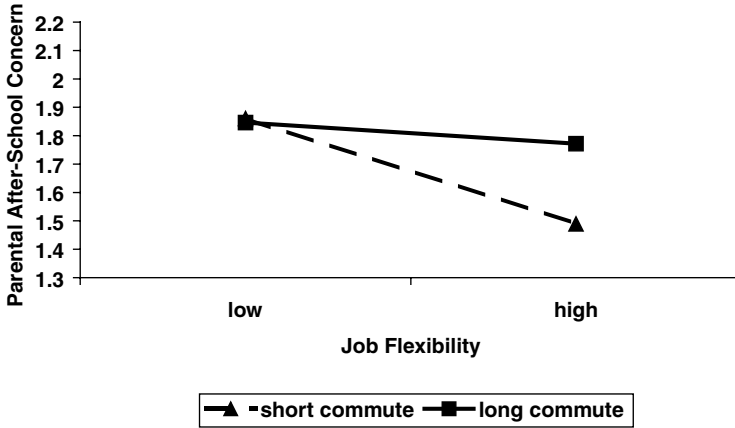
Figure 2 Significant Moderating Effect of Commuting Time on the Relationship Between Child's Time Unsupervised and Parental After-School Concern