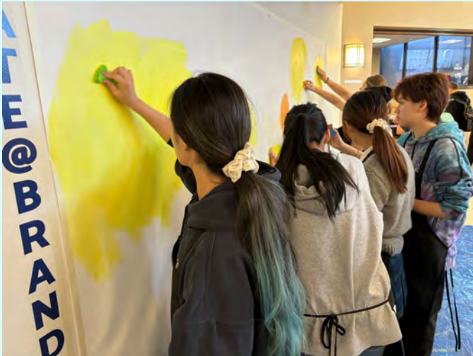
Artists' Jumping Into Action