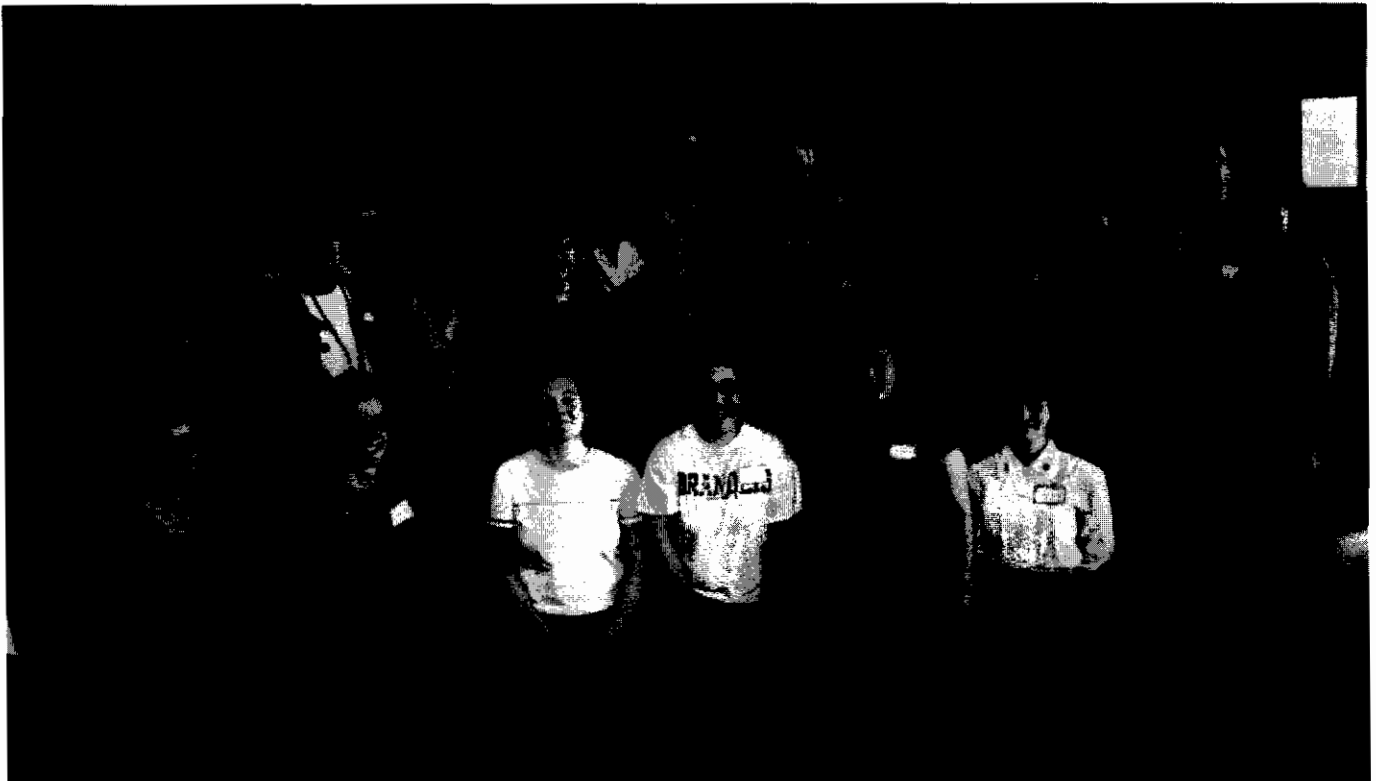
Faculty, students, and friends at the LAS luncheon April 30.