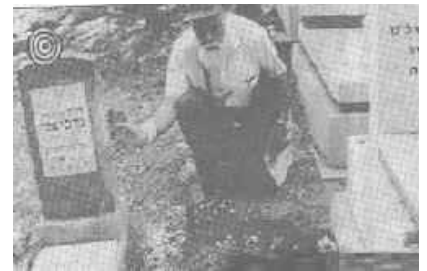
Allegedly empty graves of Yemenite children, shown on Israeli TV.