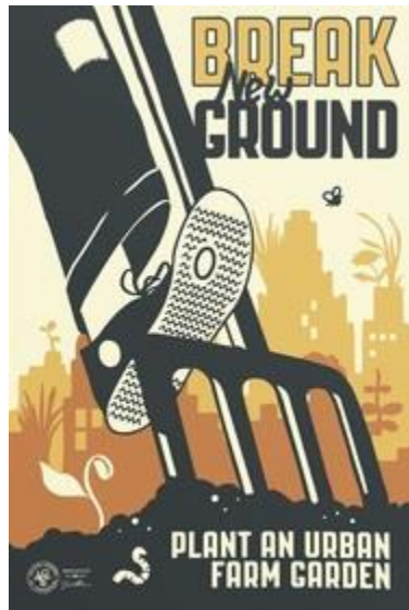
Poster: "Break New Ground - Plant an Urban Farm Garden" by Joe Wirtheim, www.victorvgardenoftomorrow.com .