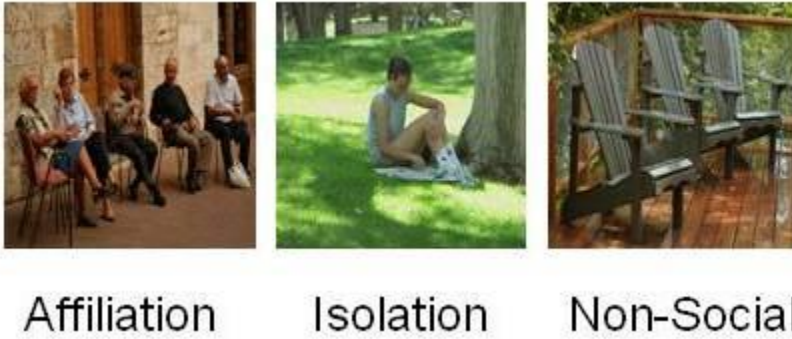
Figure 1. Participants viewed and made ratings of pleasantness for three different stimuli conditions: affiliation (images of groups of individuals interacting; left), isolation (images of a lone individual; center), or non-social (images of objects and landscapes; right).