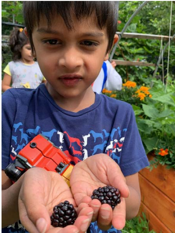
"I found blackberries!"