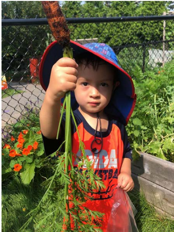
Hard to get fresher than a carrot right from the dirt