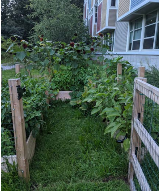
The raised bed we planted in June is filled with sunflowers and produce now.

This month we hosted two additional family garden days during which we encouraged children to make observation drawings and create art by searching for different shapes and colors of leaves and laminating their arrangements.