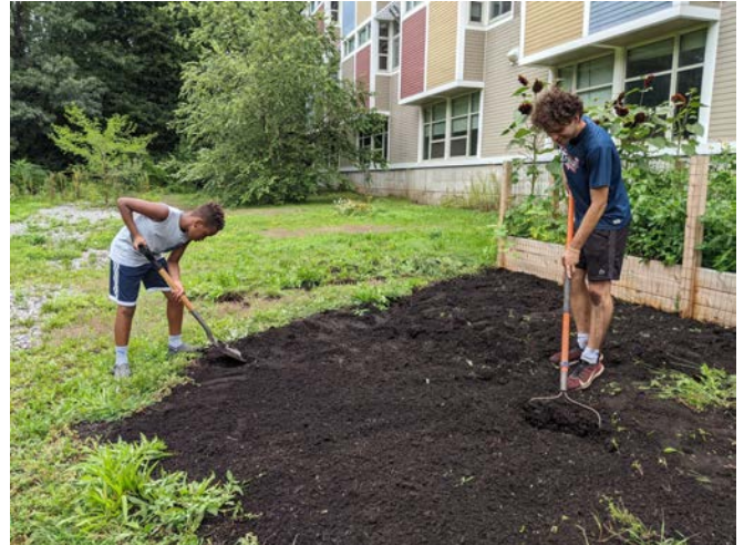
Creating a new garden bed

Families helped us with more weeding, pruning, invasive plant removal, and the creation of a new bed area. We planted radish seeds along the edge of the new bed. Radishes have a short growing season so we hope that some will be ripe by late fall. Families also harvested tomatoes, peppers and more to bring home and enjoy.