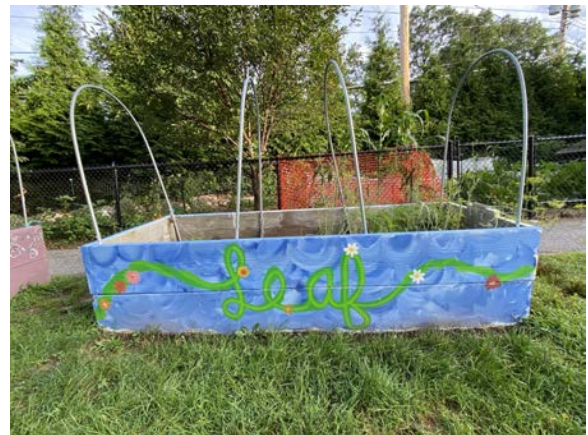
One of the many new paintings on our raised beds

As the summer winds down, so has our high school internship! All nine participants have been incredibly valuable members of our team, helping to maintain our gardens and provide fresh fruits and vegetables for our families, and helping to support the local ecosystem by planting native species and removing invasives. We will remember their hard work through the beautiful artwork they left us on our raised beds, and we wish them all luck in their upcoming school year!