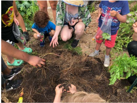
Picking potatoes out of the dirt