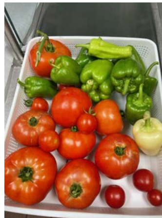
Some of our harvest

Before the first day of school, some of the Stanley teachers harvested additional veggies, including tomatoes that will be used on salads in the school cafeteria!