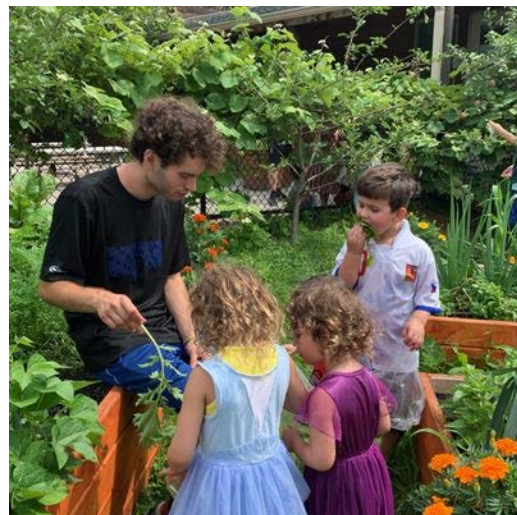
Sometimes the food doesn't last long enough to become a rainbow.

While searching to make our own rainbow, we also learned about the importance of healthy healthy. One of the best ways to do this is by eating a colorful plate. The more colors on your plate the more nutritious your meal will be and the healthier we'll all grow!