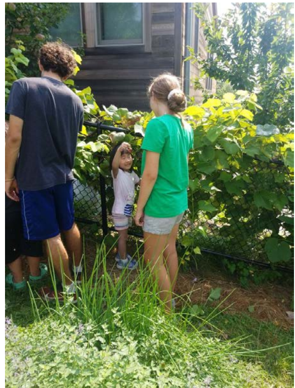
"Can you hold this?"

conveniently hold what they picked. Each kid went home with a bag filled with fruits and vegetables.