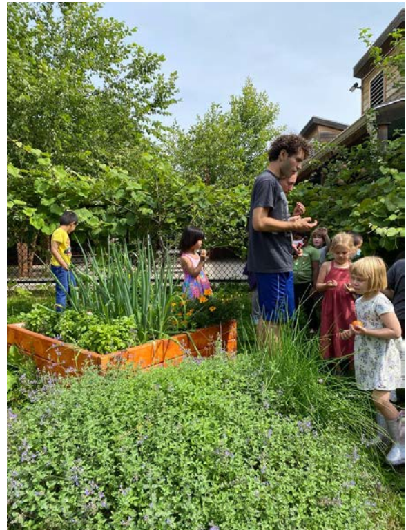
What can I eat in this bed?

Using the skills they learned last month, the kids were able to apply their mastery of harvesting. They filled bags with fruits and leafy greens. Many were able to identify what they were picking all on their own!