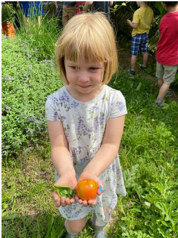
"That tomato's the size of your hand!"

Despite the recent heat wave our garden continued to blossom and bear fruit! Zucchini, grapes, corn, beans, beets, carrots, and mizuna kept growing. Perfect for harvesting. We even had a cucumber that grew successfully despite the best efforts of fungus. We also found some huge tomatoes!