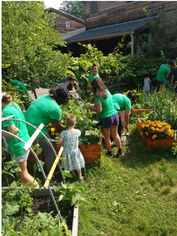
We love making new friends

For the summer's last garden activity we had a surprise for our friends. Each friend got paired up with one of the high school LEAF participants. As a team, our buddy pairs had free reign of the garden and got to harvest whatever was ready.