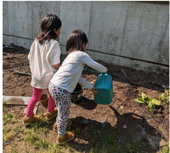
Watering the squash we just planted.

The Stanley garden has been thriving this spring. At the end of May, we had our first garden day for students and parents. Together we weeded the beds and planted various veggies. We built and filled a new raised bed, and we harvested radishes, arugula, and mint. We'll have two more garden days in June before the end of the school year.