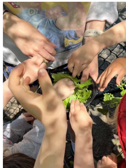
Our collection filled a whole bowl!

In the fairy garden, we looked at garlic mustard plants, observing their tiny white flowers, straight stems, and broad, serrated leaves.