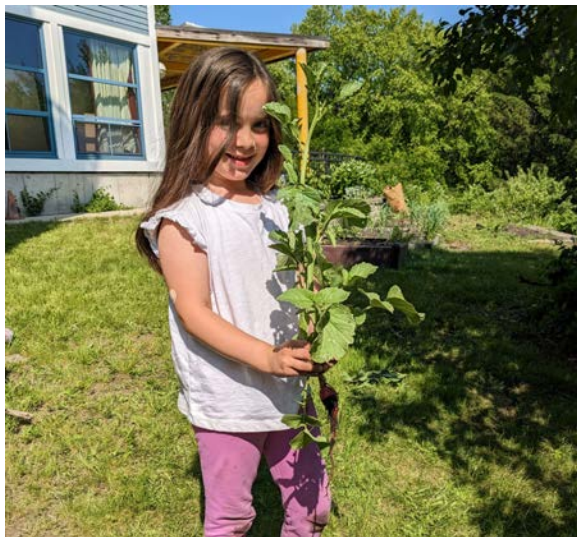
A large radish!