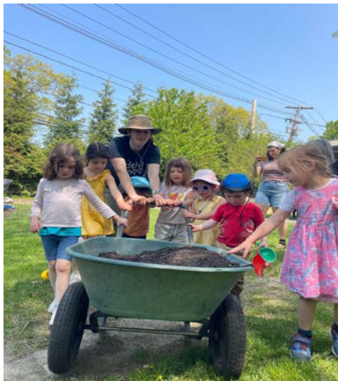
Teamwork between toddlers and preschoolers