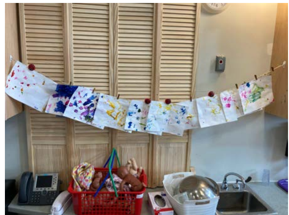
Displaying the garden art in the classroom

garden space to collect different objects to paint with - flowers, leaves, sticks, rocks, and more. Using different colors, we dipped our objects and made beautiful colors.