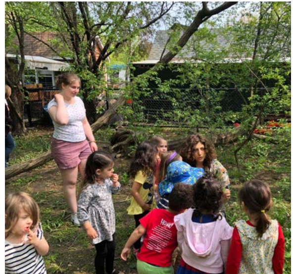
Searching for garlic mustard

Spring means all plants are getting a boost, growing green and tall, including weeds and invasives! We discussed what weeds are - plants that we don't want to grow - and why we want to remove them - they can take up soil space, sunlight, nutrients, and water that the plants we want to grow need! We learned a new term, "invasive," which describes plants that like to take over and push out other plants. Rather than just trashing the plants, we mentioned other ways we can use them, such as making yummy pesto!