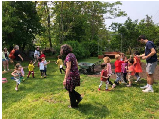
The kids running back and forth, pollinating!