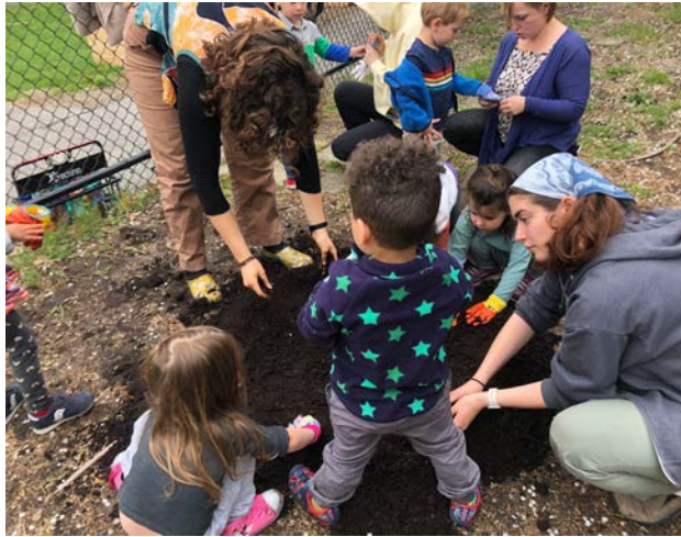
We created a mound of soil with our hands.

We then went outside to the garden, creating a mound of soil and circularly planting the corn, bean, and squash seeds. After we covered the seeds in the rich soil, we watered them. We can't wait for them to grow strong together!