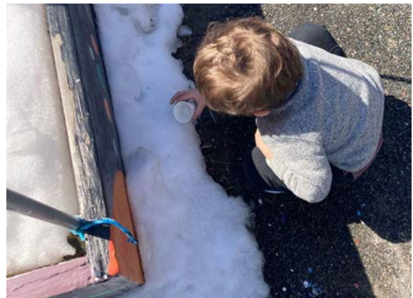
Pouring out the salt to see what happens

With the Voyagers, we ventured outside with small cups of salt to see how the snow dissolves when we sprinkle, exploring melting and freezing.