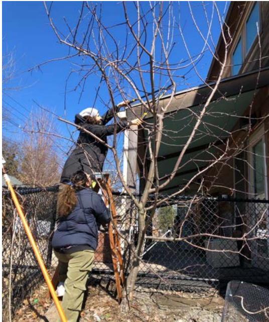
Lopping off some water sucker branches!

The garden keeps marching on, because it's March! March brings to the garden tasks of turning compost, pruning fruit trees, and deadheading perennials. Our garden interns are hard at work to make sure that spring starts with vibrancy and vigor. We are planning what to plant and have started utilizing the greenhouse again. There is pollen and excitement in the air, and we are so happy to see the bounties that season will continue to bring us.