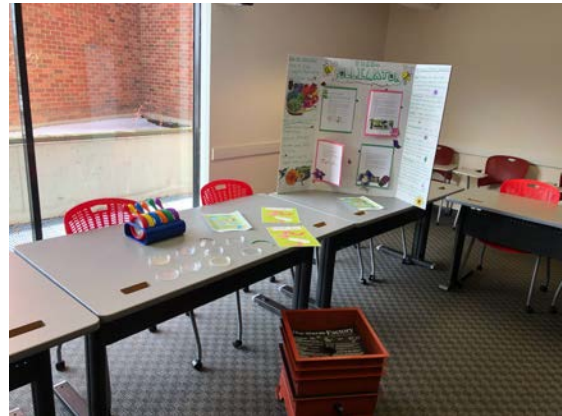
Our table of information

Program, at Brandeis for a festive worm, compost, and seed ball exploration.