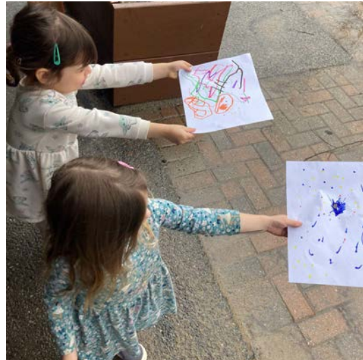
We held our papers under the drips!

them get all washy with rain to see the blending creations.