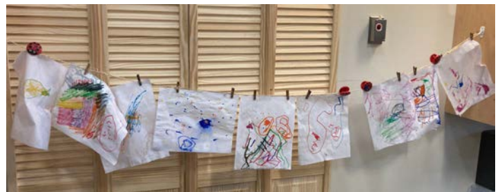
Our finished creations

Even though it was a bit too rainy for us to go jump in puddles, we stood under the awning and let our papers catch the drips. Who says we can't have fun in the rain?