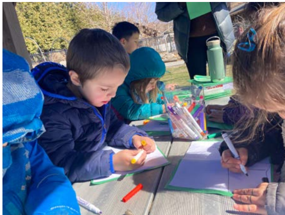
We were very focused on our drawings.

Together, we watered them. Then, we had the chance to fill in the pages of our journal with what we did - drawing the seeds, the planting process, the watering, and more! We are so excited to continue adding to our observations.