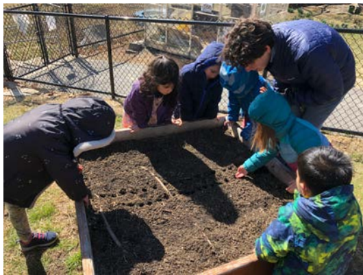
Working carefully to plant in neat rows