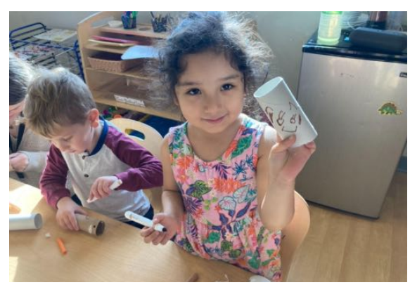
"I drew me in the garden."

Then, we had the opportunity to make our very own pair of "garden binoculars".