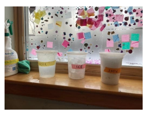
Which will melt first?

January brought us snow, giving us ample opportunity to explore the cold and beautiful flakes. With the Voyagers and Navigators, we investigated freezing and melting. First, we read Here Comes the Snow by Angela Shelf Medearis and discussed all the "gear" that we wear when we go out to play. Then, we put on our scientistic goggles and coats and conducted an experiment. In three identical containers, we stuffed snow, poured water, and stacked ice to the very top.