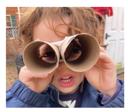
"Eye see you!"

First, we strung a piece of string through two hole-punched paper tubes. Then, we taped the two tubes together. Finally, everyone had the chance to personalize and decorate their creations. Some students chose to draw people in the garden and others utilized their favorite colors and patterns. So fun!