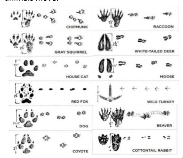
So many different types of footprints!

After reading the same book, we donned our snow pants, snow boots, gloves, hats, and scarves to go on a scavenger hunt for animal prints and tracks. We realized that the snow acts as the perfect canvas to discover the ways animals move.