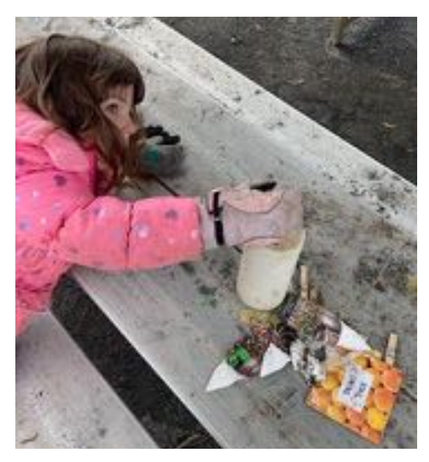
Some of our collected trash.

Together, we worked to sort through and decide where we should dispose of the objects. Now, we are on our way to becoming recycling experts, and we will keep on practicing inside our classrooms!