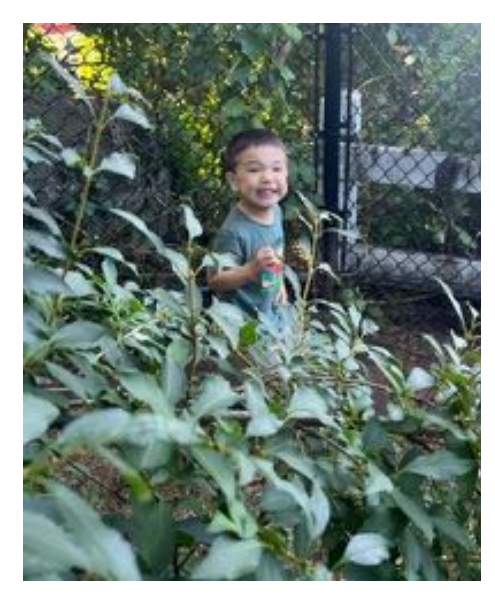
We are so excited to be outside!

September is a time of abundance and harvest. Many of our summer crops are ripening, and we can see the beginnings of our fall crops popping up. September also brings the early tastes and scents of autumn... with the flavors of butternut squash, the taste of tart apples, and the sensation of a chilly morning's crisp air. We are filled with joy to be back outside and in the classrooms, teaching lessons and engaging with the outdoors.