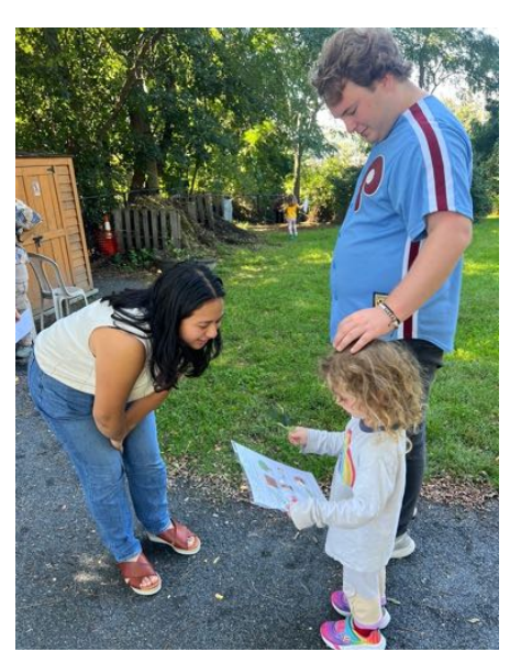
"What did you find?"

We then wandered around the garden conducting a scavenger hunt, searching for leaves, needles, pine cones, birds and insects in trees, fruit trees, and more!