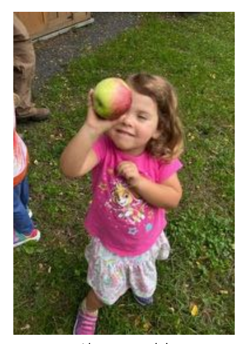
I love my apple!

Once tasting some of our findings, like cucumbers and tomatoes, we sought out our ripe apples. As we cut them open to investigate the seeds, we noticed how a horizontal cut shows a star. With paint and paper, we conducted an experiment to see if the star would work as a stamp.