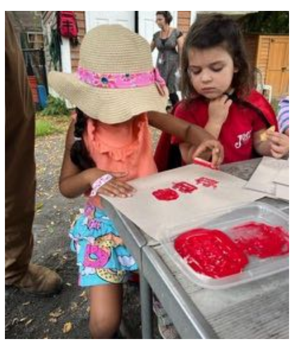
Apple stamping is a lot of fun!

Even though it was hard to see the star in our final creations, we learned that fresh apples taste delicious AND can help us make beautiful art.