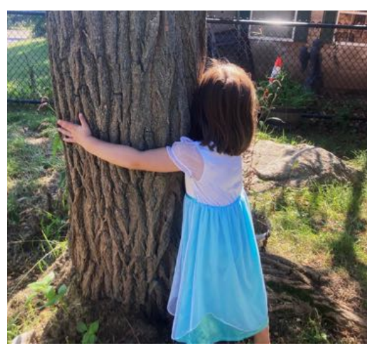
"I love you!"

It was so fun to go to the garden with the eyes of a detective, looking for the clues that trees leave us. Through our investigation, we realized that there are many types of trees and that they are essential to all the other creatures around them. Thank you, trees!