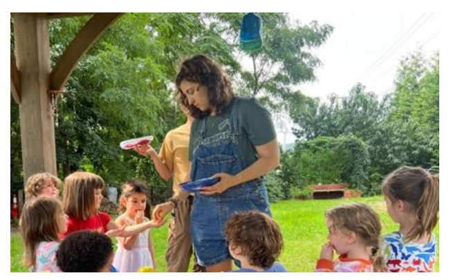
We got to taste some apple in the process!

Once tasting some of our findings, like cucumbers and tomatoes, we sought out our ripe apples. As we cut them open to investigate the seeds, we noticed how a horizontal cut shows a star. With paint and paper, we conducted an experiment to see if the star would work as a stamp.