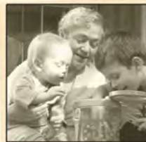
Mary Catherine Bateson