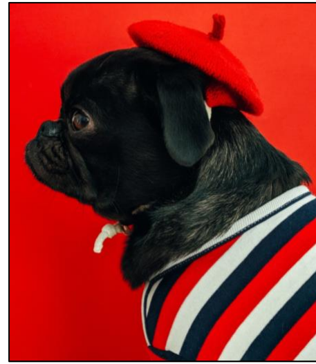
Toshi (https://www.instagram.com/toshi.dog/) wearing a beret.

(1) M,W,Th 12:20–1:10 PM, Niehaus Prerequisite: FREN 104b, or the equivalent. Permission required (please see instructions in box on first page, center). Improve your speaking skills while learning about and discussing socio—cultural issues that distinguish the French view of the world from that of Americans. Students will focus on expressing themselves better orally while continuing their work on reading, listening, & writing.