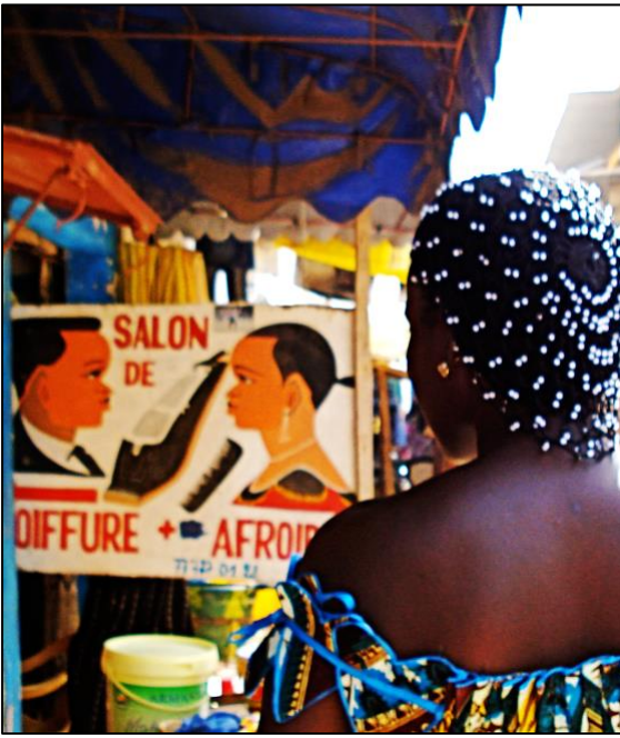
Senegal. 2007