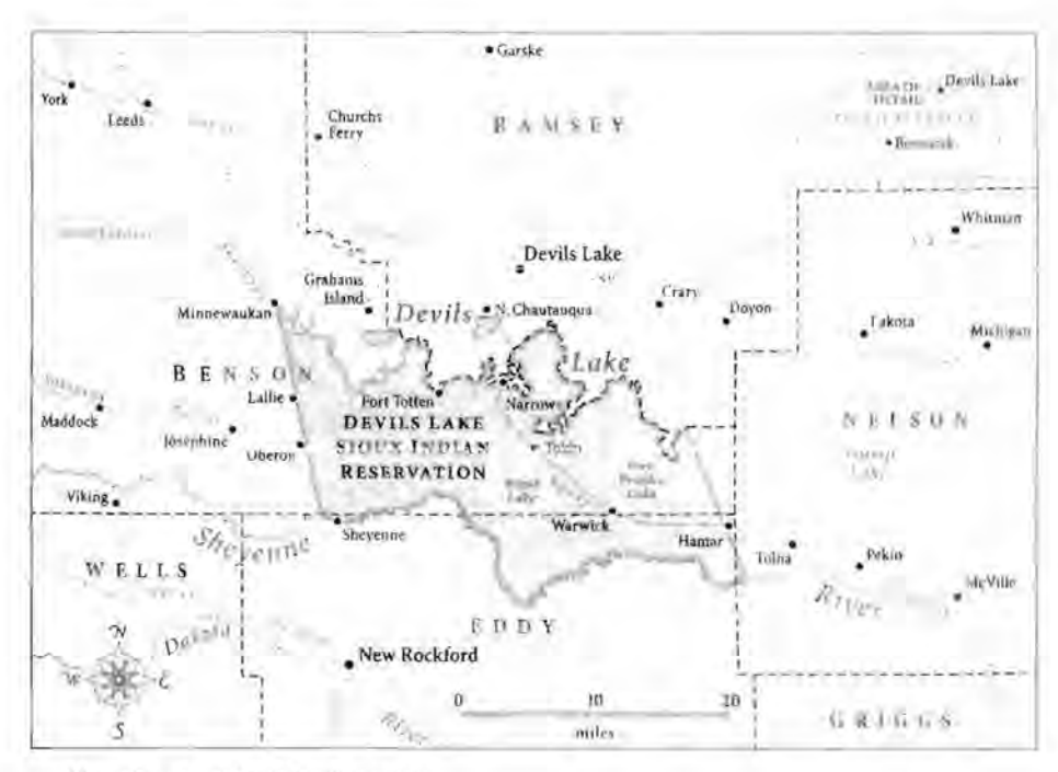
Map showing Devils Lake region

Norwegians were actively recruited by the territorial government through propaganda published in Norwegian and agents sent to Norway.<sup>15</sup>