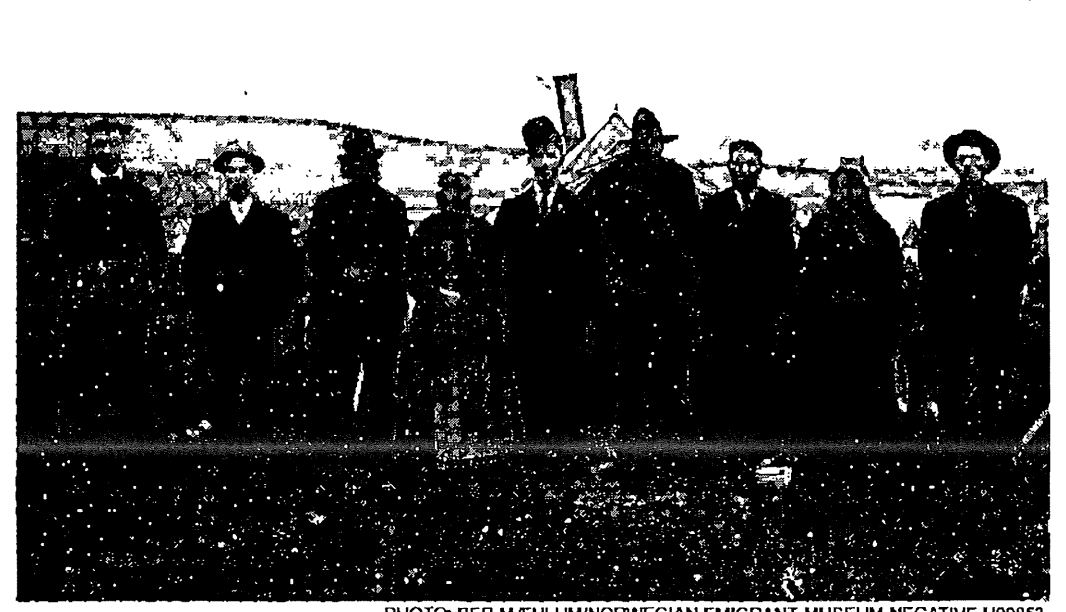
Norwegian immigrants with their Native American neighbors, Kathryn, North Dakota, 1909-10.

histories, sixteen of which were with first-, second-, and thirdgeneration Norwegian immigrants.<sup>24</sup> In addition, our analysis draws from forty-six oral histories with Norwegian-Americans based in Benson, Eddy, and Nelson counties of North Dakota, conducted by the North Dakota Oral History Project in 1975-1976. The majority of these were second-generation Norwegian-Americans who had at least one parent born in Norway and identified as Norwegian, although four interview subjects were born in Norway. Slightly more interviews were conducted with men than with women. The corpus of oral histories is an invaluable resource representing several generations of narrators, with subjects born as early as 1878, and speaks to change over time.