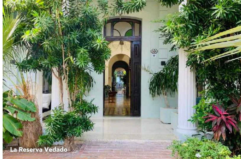
La Reserva Vedado

Amid the serenity of a residential street, this colonial mansion, recently renovated, exudes the cosmopolitan energy of mid-20th-century Havana. Art and sleek design permeate every corner of La Reserva Vedado, serving as distinctive markers of its identity. Discover a tranquil oasis, a hidden gem offering respite from the city's bustling streets.