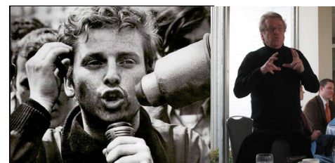
Daniel Cohn-Bendit in Paris in 1968 and at Brandeis in March 2008

The 1960s seem to have gained almost mythical status among the younger generations. Students today view the sixties with some envy. To them, the sixties represent a time of opportunity, when social and political change seemed very possible. At the time young people were united across the world against war and aggression through music, protest, and social experimentation. Yet the circumstances and expressions differed greatly from those in the United States.