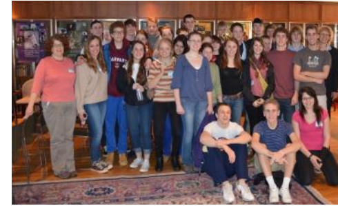
Students and their teachers from Grimm event

German and an afternoon panel discussion in English. The program began with the arrival of 60 German language and native German high school students and their teachers. After a tour of campus and German style breakfast, the students participated in