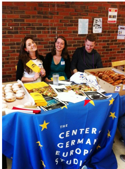
CGES students at "Do Deutsch" table