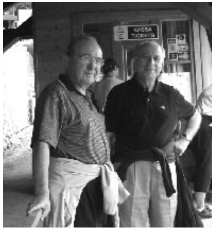
Richard Goldstone and Fausto Pocar, ICTY, wait for a cable car in the mountains outside of Salzburg.

In conclusion, participants agreed that courts must examine themselves closely, engage in constant dialogue with observers and experts, and listen to criticism and public opinion about their performance. But, they agreed, courts must also clearly distinguish between the aims of international justice and the desires of constituents. Only in this way will they justify their existence, ensure adequate support for their work, and remain true to their missions.