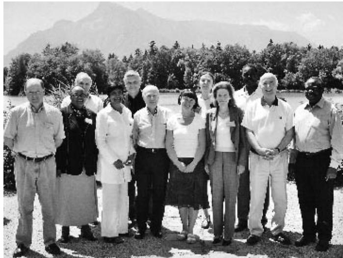
BIJ 2004 judges