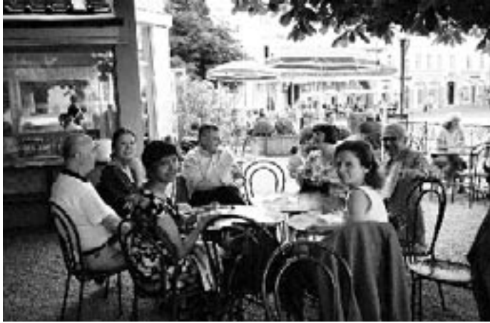
Judges enjoy a relaxing moment in Salzburg's Old City.

What happens, however, when judges protest that they are impartial and even refuse to recuse themselves? What is the responsibility of fellow judges as “watchdogs” in such situations? BIIJ participants considered three recent examples of this exact scenario during the “Topics in Ethical Practice” session. The first, alluded to above, was the removal of Geoffrey Robertson of the SCSL from trials involving the rebel group. His fellow judges voted that it was in the best interest of the court that he recuse himself. The second example pertained to the potential recusal of a judge of the International Court of Justice (ICJ) from deliberations on the legal consequences of the construction of a wall in the occupied Palestinian territory. Judge Nabil Elaraby, who had previously published critical pieces on the state of Israel, was considered by certain colleagues to be biased on this subject. The overwhelming majority of the ICJ bench, however, supported his participation in the deliberation process. The third example took place not in an international court but in the United States Supreme Court. Judge Antonin Scalia refused to recuse himself from a case involving U.S. Vice-