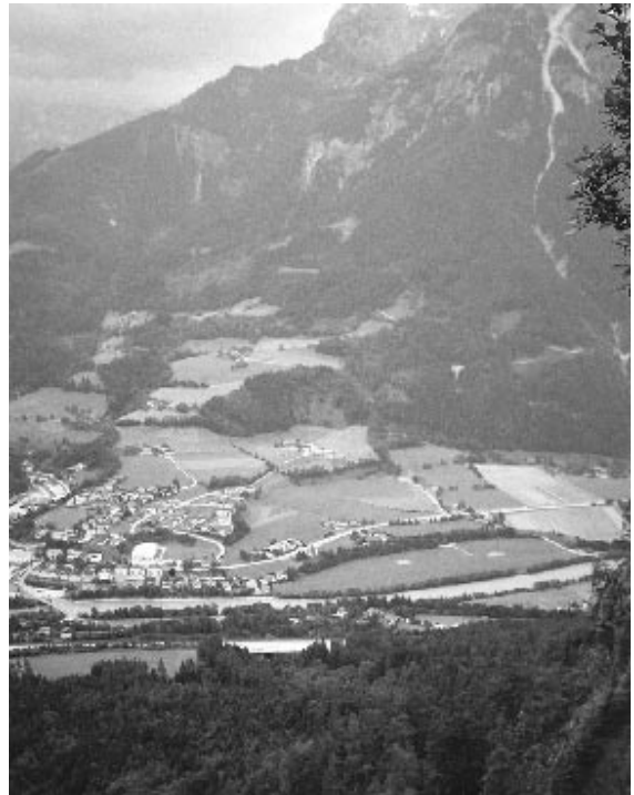
A view from the Eisriesenwelt Werfen, the world's largest ice cave