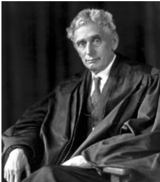
Louis Dembitz Brandeis

Brandeis University is the youngest private research university in the United States and the only nonsectarian college or university in the nation founded by the American Jewish community.