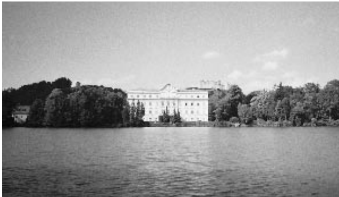
Schloss Leopoldskron, Salzburg, Austria

It is a unique experience to meet independent and international judges from nearly all continents and nearly all major international courts and tribunals. It is an eye-opening experience to become aware that your own problems are at the same time the problems of your, until then, unknown colleagues. It is encouraging to see and feel the common desire to establish new avenues to truth, justice, and peace.