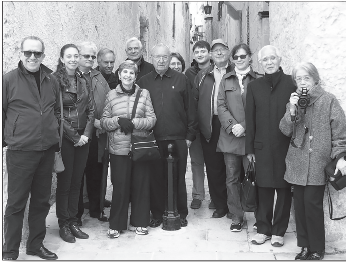
Some BIJ participants on a tour of the historic Maltese city of Mdina

However, this activity was not entirely unproblematic. Speaking about the wide scope for victim participation in the ICC, one participant noted that NGOs were sometimes responsible for creating expectations that the court may not be able to satisfy.