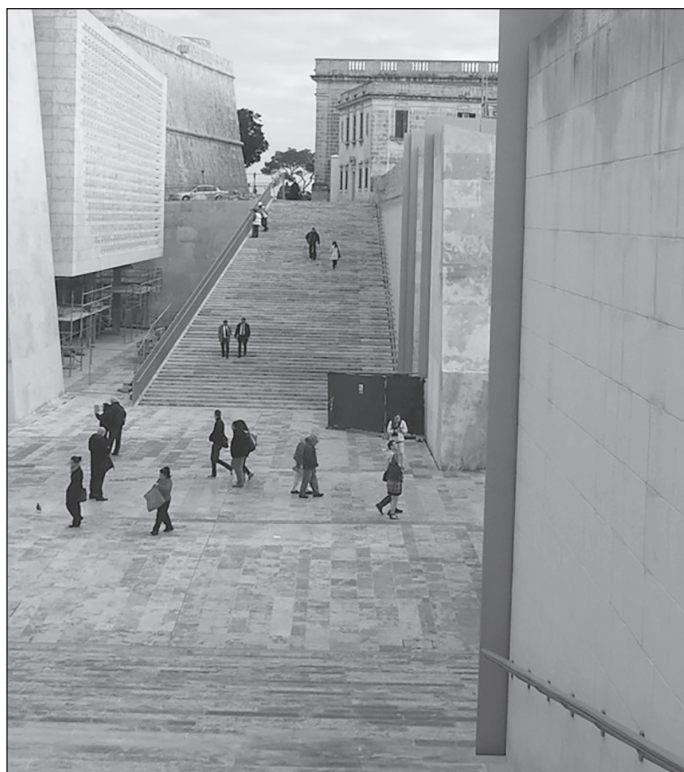
The modern Renzo Piano gate to the old city of Valletta

Another interesting mechanism for enforcing judgments of international judicial bodies was identified in the context of the order made by the SADC Tribunal against Zimbabwe,