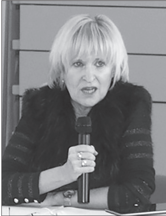
ICC Judge Christine Van den Wyngaert offers her perspective during a plenary discussion

and circumstances at times incline them towards active collaboration and at other times towards non-cooperation. This political aspect is distinct from, but closely interconnected with, technical legal factors such as constitutional constraints on the powers of different branches of government, which can impede or promote the implementation of international law in domestic arenas.