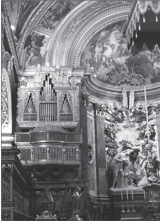
The magnificent interior of Valleta's St. John's Co-Cathedral, home of the Knights of Malta

is not taken care of. Some states implement the statute partially, but I don't know of any state that has implemented the ICC statute completely.”