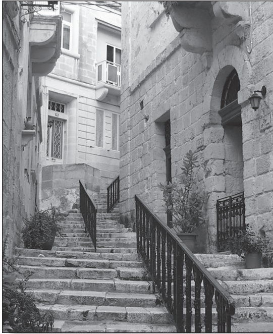
A stairway in the labyrinthine lanes of historic Malta

was no evidence that the Maltese authorities had taken any steps to arrange for the removal of the applicant from Malta during the entire period of her detention, despite the requirement that a person shall only be detained for as long as deportation or extradition proceedings are in progress. In both judgments, the Court recalled numerous previous instances where it had found Malta's legal procedures to fall short of its obligations under Article 5.