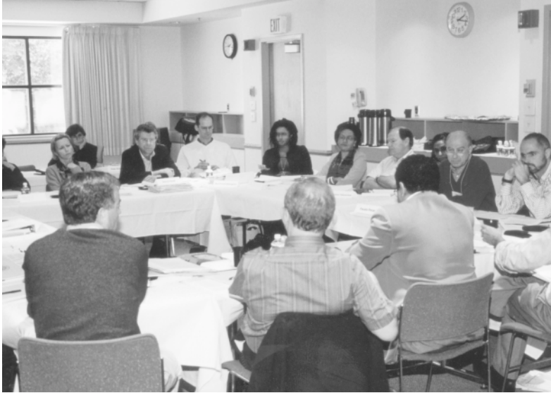
Judges in discussion with Institute faculty and guests

This problem is most acute in international courts where judges are permitted to stand for reelection, in which case they might be subject to pressures while they are sitting members of the courts. BIIJ participants felt that the issue of reelected judges deserves further sustained examination.