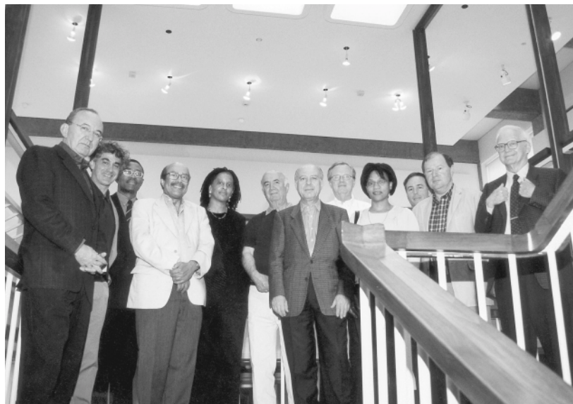
Participants in the Brandeis Institute for International Judges

The Institute addressed the following topics within the overarching theme of "The New International Jurisprudence: Building Legitimacy for International Courts and Tribunals":