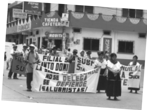
(Lower left) A protest in Mazatengano (my host city for the majority of my time). The government is currently trying to privatize all health services in the country and this was a demonstration by a coalition of union members and indigenous people against privatization.