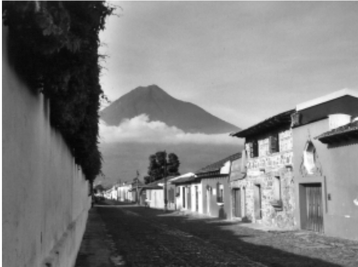
At left is a classic view in Antigua, Guatemala, the old colonial capital where Xiomara and I stayed our first month in Guatemala. In the background is El Volcan de Agua.