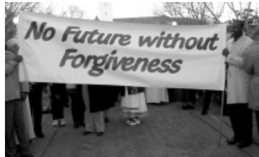
(Above) One event at the Grahamstown Arts Festival featured Desmond Tutu and other renowned speakers involved with the Truth and Reconciliation Commission. This was the beginning of a mini peace march from Rhodes University to the chapel in the center of town.