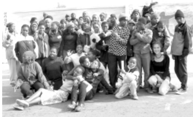
Some students elected to create a mural as their final project for the Winter Programme. On the last day, we visited to take pictures and hear how they envisioned "survival" and were depicting it through art.