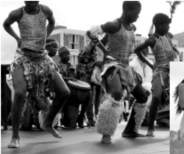
During one of Ikamva Labantu's youth day projects, Marimba dancers entertained the crowd at a Youth Day celebration in Fishock.

• Location can be everything. Relationships are forged through Ikamva Labantu that might never be forged otherwise because it is a meeting ground for people with the common goal of improving the quality of life in South Africa. Individuals put aside racial, ethnic, and socio-economic differences to collaborate. However, the geographic and economic divide between communities frequently prohibits them from being able to socialize outside of work due to safety, cost, and time.