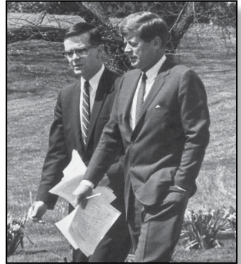
Ted Sorensen with President Kennedy

The Sorensen Fellowship Program of the International Center for Ethics, Justice and Public Life honors Theodore C. Sorensen (1928-2010) for his lifelong commitment to public service and for his 10 years as Founding Chair of the Center's International Advisory Board. Ted Sorensen was policy advisor, legal counsel and speechwriter to President John F. Kennedy. In 2008 he wrote, "We shall listen, not lecture; learn, not threaten. We will enhance our safety by earning the respect of others and showing respect for them. In short, our foreign policy will rest on the traditional American values of restraint and empathy, not on military might." In focusing their internships and their writing on themes of empathy, respect and trust, the Fellows pay fitting tribute to the public servant for whom the Sorensen Fellowship is named.