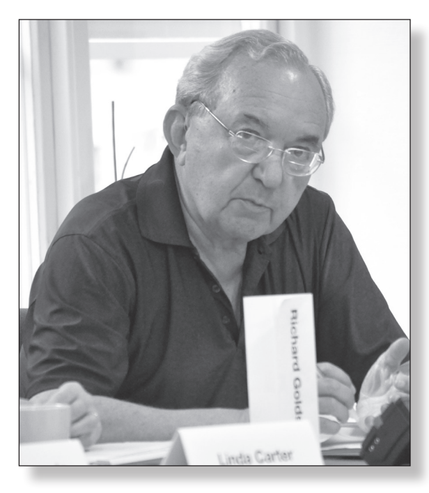
Justice Richard Goldstone, BIIJ co-director.

respondent State. A strategy adopted by the ECtHR to deal with large groups of identical cases that derive from the same underlying problem is that of "pilot judgments." 27 It is critical that States that have not been parties to specific cases follow the case law nonetheless and adapt their legislation and practice in order to avoid similar violations. In other words, authoritative interpretations of human rights norms by the ECtHR affect all members of the Council of Europe.