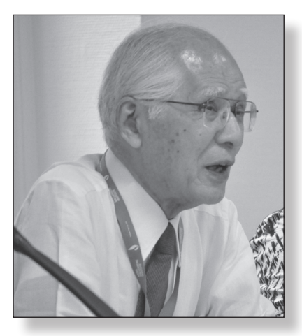
Judge Hisashi Owada of the International Court of Justice.

This report of the Lund session provides an extremely interesting and useful read for those working in the field of international justice and human rights.