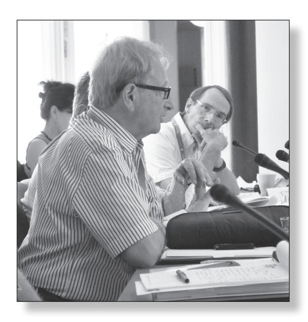
Judge Carmel Agius of the International Criminal Tribunal for the former Yugoslavia makes a point, as Judge Erik Møse of the European Court of Human Rights listens intently.