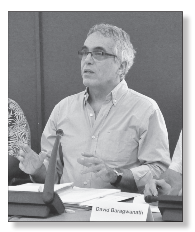
Judge Diego García Sayán, President of the Inter-American Court of Human Rights.

A criminal judge noted that it is important to move beyond the language of legal instruments and look at what is happening on the ground when evaluating the status of so-called universal rights, relative or not. There is a difference, she asserted, "between the practical universality of human rights and the universal condemnation of a wrong." She continued, "If you had access