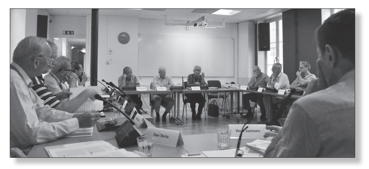
BIIJ participants in session in a conference room of the Raoul Wallenberg Institute.

26. DAVID HARRIS ET. AL., LAW OF THE EUROPEAN CONVENTION ON HUMAN RIGHTS 11 (2d ed. 2009), at 11.