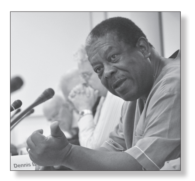
Judge Dennis Byron of the Caribbean Court of Justice offers a comment.

This discussion of victims' rights was then interrupted by another conceptual challenge: How can a court classify certain individuals as