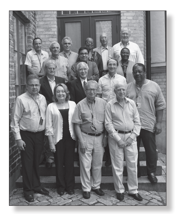
International judges at BIIJ 2013.

he principal goal of BIIJ 2013 was to examine the growing influence of human rights on legal thinking and practice, as well as on the work of international judges and their institutions. This was the third session of the BIIJ to explore the notion of an international rule of law. Previous institutes had focused on the development of such a global legal framework (2010) and the role of coordination and collaboration in realizing it (2012). Plenary sessions in 2013 sought to advance earlier discussions by identifying the ways in which contemporary international justice is influenced by the "human rights era" in which we live, and by sharing thoughts about how best to ensure that populations across the globe benefit from this heightened awareness of human rights issues.