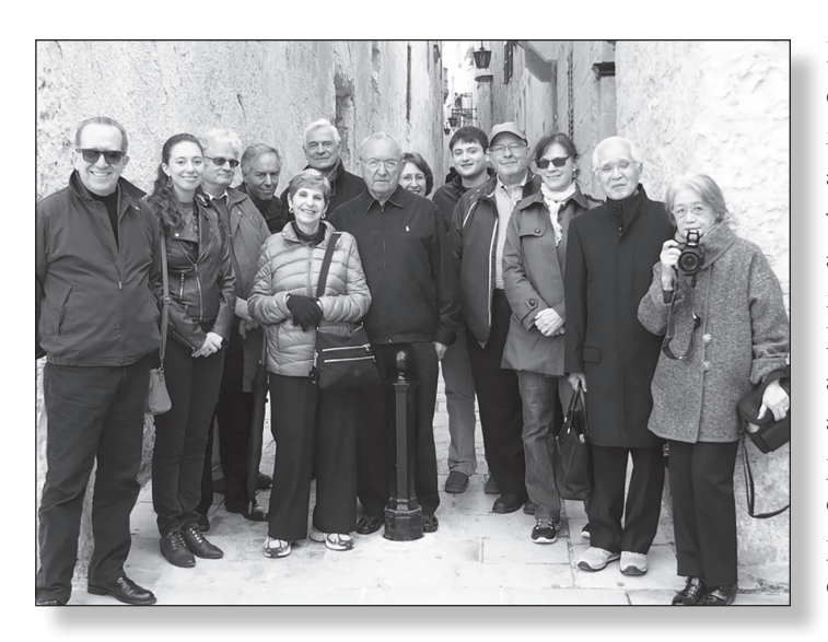
Some BIIJ participants on a tour of the historic Maltese city of Mdina

However, this activity was not entirely unproblematic. Speaking about the wide scope for victim participation in the ICC, one participant noted that NGOs were sometimes responsible for creating expectations that the court may not be able to satisfy.