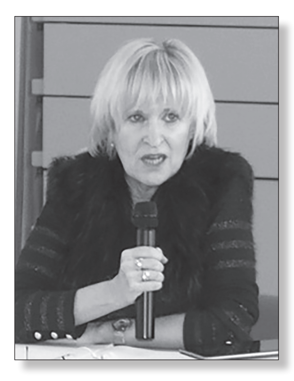
ICC Judge Christine Van den Wyngaert offers her perspective during a plenary discussion

and circumstances at times incline them towards active collaboration and at other times towards non-cooperation. This political aspect is distinct from, but closely interconnected with, technical legal factors such as constitutional constraints on the powers of different branches of government, which can impede or promote the implementation of international law in domestic arenas.