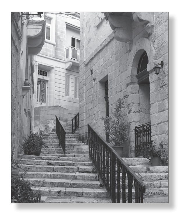
A stairway in the labyrinthine lanes of historic

was no evidence that the Maltese authorities had taken any steps to arrange for the removal of the applicant from Malta during the entire period of her detention, despite the requirement that a person shall only be detained for as long as deportation or extradition proceedings are in progress. In both judgments, the Court recalled numerous previous instances where it had found Malta's legal procedures to fall short of its obligations under Article 5.