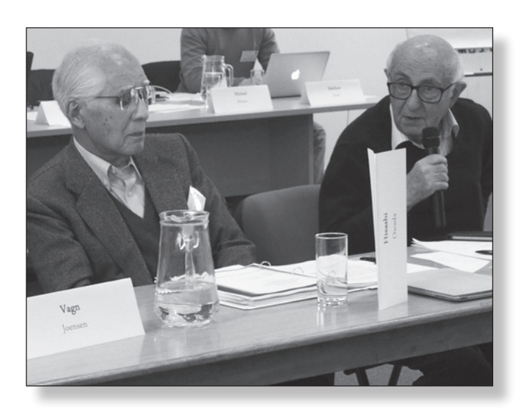
(I to r) ICJ Judge Hisashi Owada and ICTY President Theodor Meron

by Argentina in the International Court of Justice (ICJ) against the United States of America<sup>5</sup> asserting that the United States had "committed violations of Argentine sovereignty and immunities... as a result of judicial decisions adopted by US tribunals concerning the restructuring of Argentine public debt."6 An act by the domestic legal order of the United States is thus being challenged before the ICJ for its alleged violation of international law and consequent adverse impacts on Argentina.