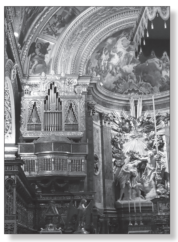
The magnificent interior of Valleta's St. John's Co-Cathedral, home of the Knights of Malta

is not taken care of. Some states implement the statute partially, but I don't know of any state that has implemented the ICC statute completely."