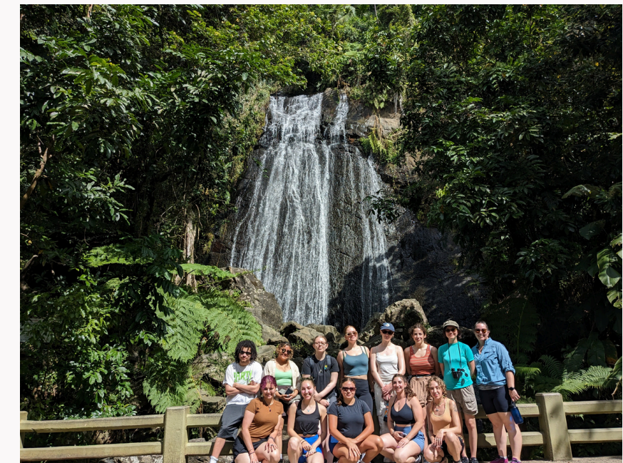
Brandeis in Puerto Rico: Environmental Studies in the Caribbean