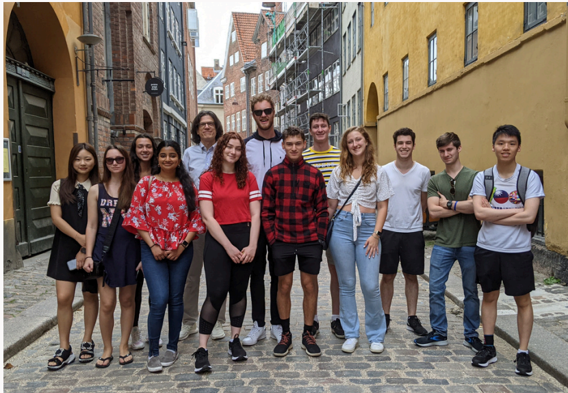
Brandeis in Copenhagen: Business and Economics in Denmark