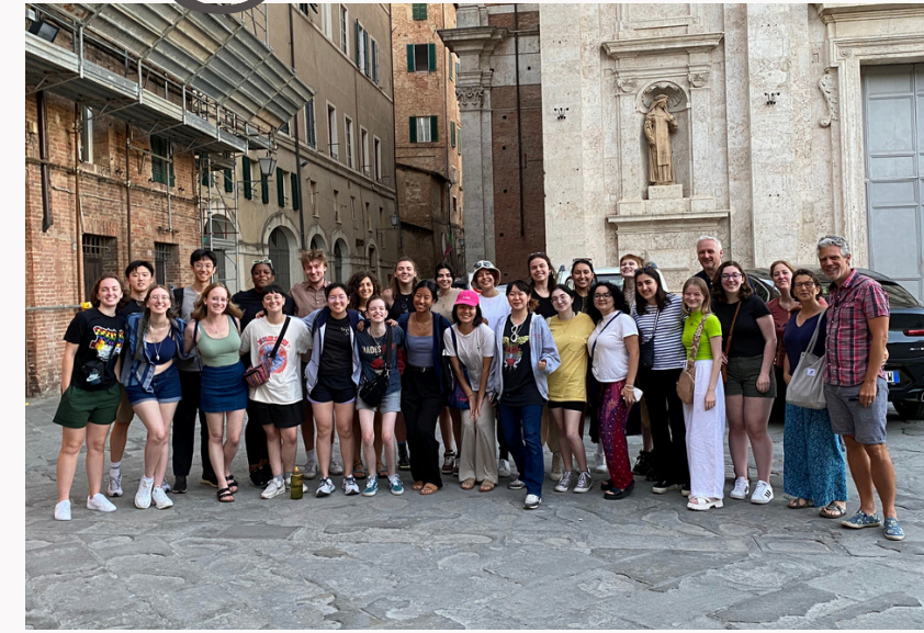
Brandeis in Siena: Making, Seeing, and Mastering Art in Tuscany