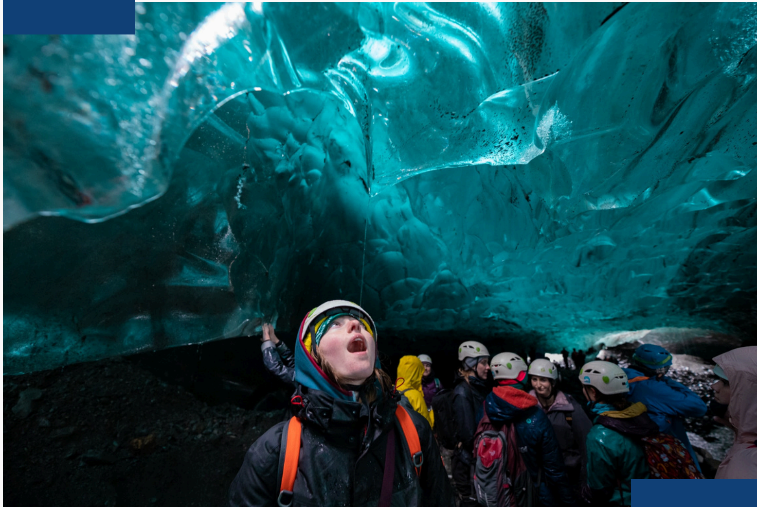
Breiðamerkurjökull Glacier, Iceland

The Office of Study Abroad helps students live and learn in a new and different cultural context as part of their Brandeis education. The staff of the Office of Study Abroad assist students in accessing educational experiences that foster their development as global citizens through cultural, academic, and linguistic immersion. Aligned with the core Brandeis mission to center social justice, we strive to provide students with opportunities to learn about global inequality and structural social injustices in order to engage as active citizens in our multicultural world. We are committed to assisting any student with a desire to go abroad in finding an opportunity that aligns with their personal, professional, and academic goals. We believe and actively promote the notion that a student's identity, financial background, and/or academic discipline should not be a barrier to an educational experience abroad.