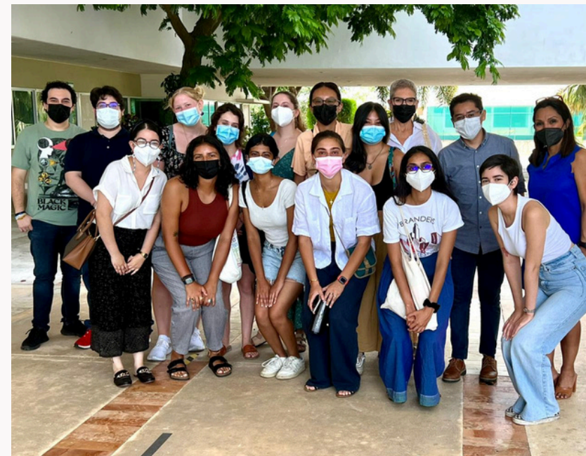
Brandeis in Mérida: Public Health in the Yucatán Peninsula