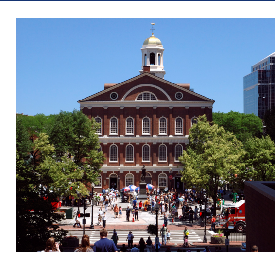
Boston's North End , a collection of Italian restaurants & historic sites