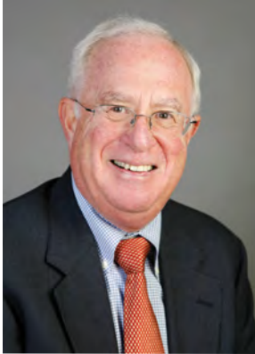
STUART ALTMAN, PhD Chairman and professor, Brandeis University

The U.S. health care system has been adapting rapidly to the new market realities created by the Affordable Care Act — but on election night 2016, the future became much less clear. The new president and Republican Congress campaigned on repealing and replacing the Affordable Care Act but have struggled to develop a proposal that can win majority support. Meanwhile, health care organizations must continue moving forward in an environment that could change drastically depending on whether Congress ultimately repeals, replaces or repairs the ACA.