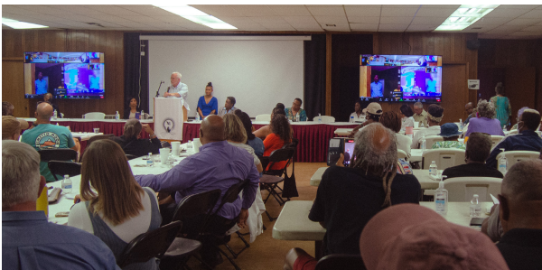
Above: USDA Representatives speak to farmers at 2022 FSC/LAF Annual Meeting