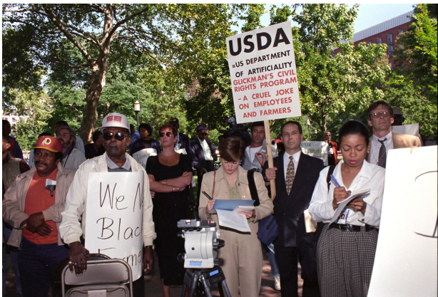
Above: Black farmers protest across from the White House in Washington, D.C. on September 22, 1997.

The American public’s conversation about reparative justice often begins and ends with financial restitution. However, community leaders have recognized that the trauma of racist and systemic discrimination expands far beyond money and lost opportunity. Reparative justice requires reckoning with decades of emotional stress, the undermining of community, lost identity, family members taken much too soon, and physical and mental health issues caused by the stress of survival in a system opposed to Black folks’ existence. This is no less the case for participants in the Black farmers’ cases.