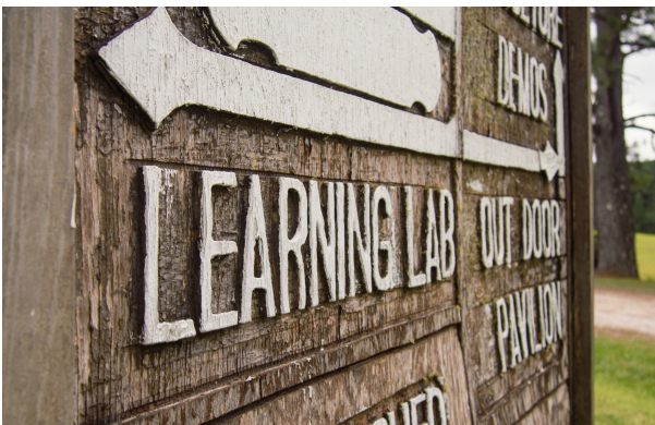
Above: Sign at the FSC/LAF Rural training and Research Center in Epes, Alabama.

“There needs to be some type of initiative that guides our youth back into farming. Our land grant institutions need to have scholarships for students who, one, have a desire to be informed but don’t have any generational farming already in their lineage, and, two, for students who have generational farming in their lineage already [and have] parents or grandparents who were farmers. Three [they need] to try to tie in all of the technology majors and direct them into farming because it’s all technology driven... all these computer science folks, they need to be steered towards Ag... And you do that with scholarships...”