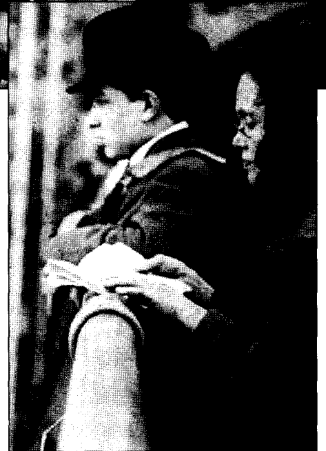
Jews praying on the Brooklyn Bridge in New York City on the Jewish New Year, c. 1905-1915.

Celebrate 350 ( www.celebrate350.org ), the national coordinating organization for the commemoration, “provides resources, stimulates ideas, and links the many projects, programs, and enterprises marking the event,” but it maintains no firm agenda of its own. It is as diverse, pluralistic, and multifocused as the American Jewish community itself. The Commission for Commemorating 350 Years of American Jewish History ( www.350th.org ), a pioneering