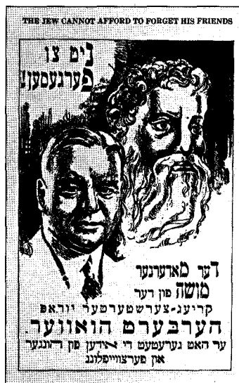
"The Modern Moses of War-Stricken Europe - Herbert Hoover. He led Israel out of the slavery of starvation and despair."

Congress's Web site ( www.loc.gov/exhibits ) and most items may be downloaded for instructional purposes. A well-illustrated catalogue, with essays by many of the foremost scholars in the field, accompanies the exhibition. The Jewish Theological Seminary's exhibition for the 350th anniversary, entitled "People of Faith, Land of Promise," also makes available wonderful primary materials in