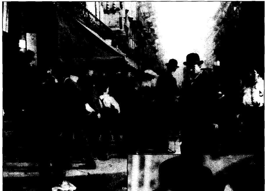
Bootblack stand in New York City, busy on Jewish New Year, September, 1905.

One point nevertheless stands out. In an era when most people view Jewish history in lachrymose terms, as a history of persecution, expulsion, tragedy, mass-murder, and now terror, American Jewry as portrayed in the 350th anniversary stands as the great