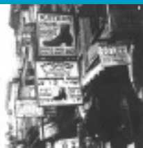
Students at Graduate School for Jewish Social work conduct a photography

project to capture images of the Lower East Side in transition from purely Yiddish-speaking area to one in which Jews became bilingual in Yiddish and English.