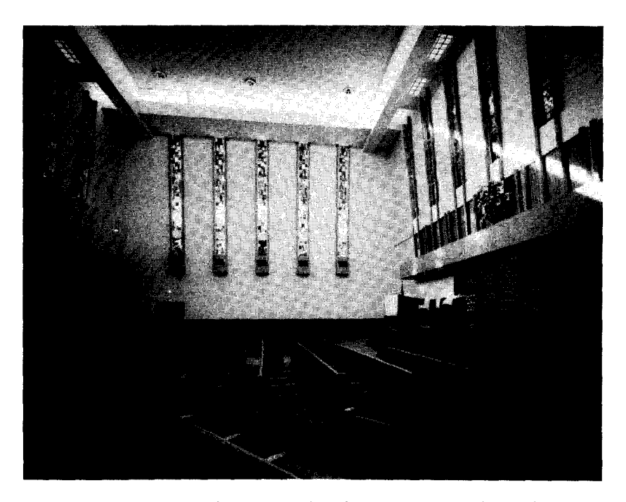
Congregation Adath Israel after the introduction of mixed seating.

the other side of the first floor of the Synagogue without any curtain or any partition between them.<sup>383</sup> In 1923, apparently in reaction to liberalization moves in many Conservative synagogues, members voted an amendment to their constitution: "that no family pews be established nor may men remove their hats during services; that no organ be used during services; that no female choir be permitted so long as ten (10) members in good standing object thereto.<sup>384</sup>