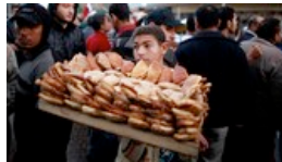
Egypt's Brewing Crisis: Subsidies