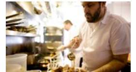
Pop-Ups Are Taking Over the Kitchen