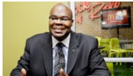
Hard Act to Follow at McDonald's