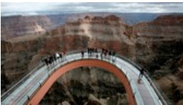
A Canyon Separates Foes in Grand Battle