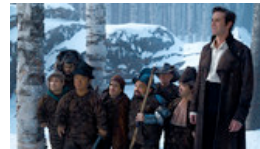
Winning a Little Dignity