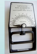
Hand Grip Instrument

Note: Correlations are presented separately for younger adults (shown in purple below the diagonal) and older adults (shown in red above the diagonal).