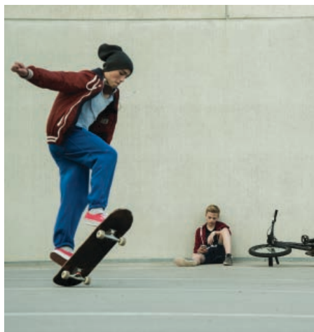
A teenager’s desire to try new things pays off in later life