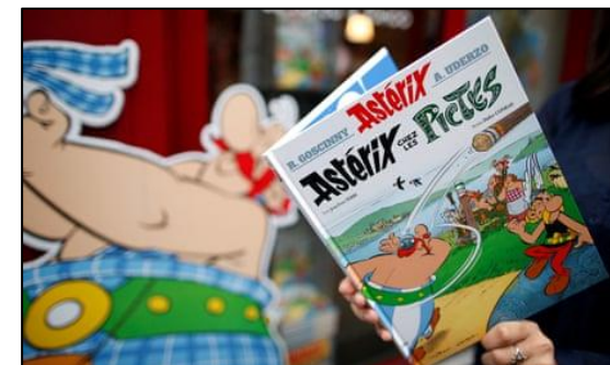
Photograph: Benoit Tessier/Reuters. From The Guardian article entitled “French comic book author Fabrice Drouot to pen next Asterix”

Did you study French in the past and need more speaking and writing practice plus a grammar review? This Intermediate French class is for you! Exploring social “controversies” like sexism and globalization, it focuses on essential communication skills such as comprehension, contemporary vocabulary use, and conversational practice. Our materials include videos, music, websites, articles, and short stories.