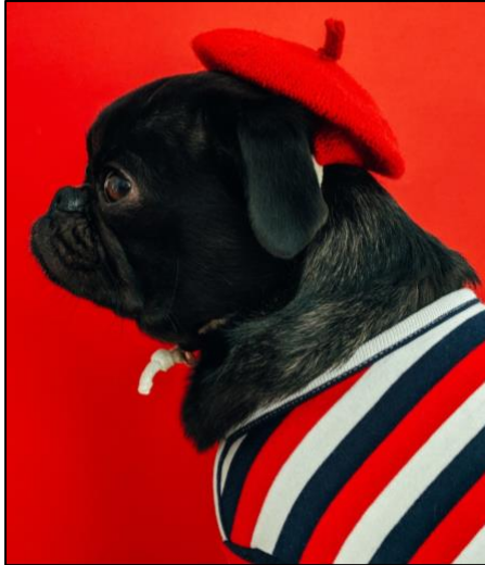
Toshi ( https://www.instagram.com/toshi.dog/ ) wearing a beret.

Improve your speaking skills while learning about and discussing socio-cultural issues that distinguish the French view of the world from that of Americans. Students will focus on expressing themselves better orally while continuing their work on reading, listening, & writing.