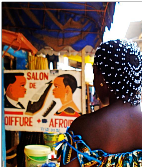
Senegal, 2007 (Jane Hale)