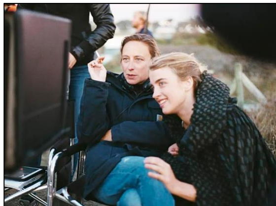
https://www.independent.co.uk/arts-entertainment/films/features/celine-sciamma-interview-portrait-of-a-lady-on-fire-adele-haenel-tomboy-girlhood-a9365411.html French director Céline Sciamma and Adèle Haenel on the set of The Portrait of a Lady on Fire

questions throughout the French-speaking world. Authors include Faïza Guène, Assia Djebar, Jacques Roubaud, Patrick Modiano, Pierre Corneille, Flaubert, and Marie de France. Films include Amélie by Jean-Pierre Jeunet and Caché by Michael Haneke.