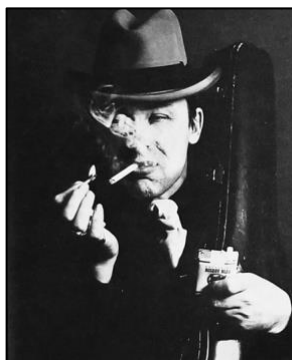
Cover, Maigret, Lognon Et les Gangsters, 1974 e.

Examines how French and Francophone detective novels take on big questions such as the origin of evil and how do you know what you know. Authors include Fred Vargas, Simenon, Driss Chraïbi, Moussa Konaté.