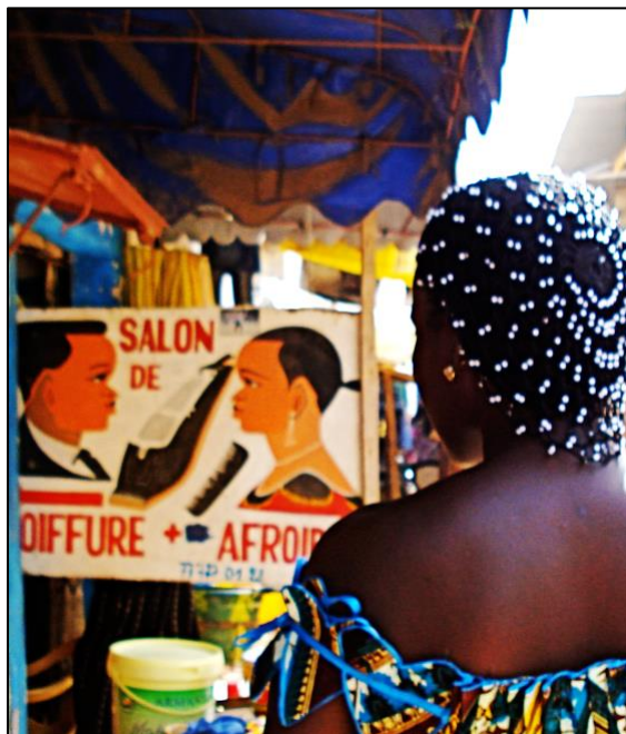
Senegal, 2007 (Jane Hale)