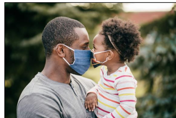
Retour de la bise : bonne ou mauvaise idée ? https://www.qare.fr/blog/retour-bise/

(1) M/T/W/R 11:15 AM–12:05 PM, Niehaus For students with little or no knowledge of French language. Permission required (please see instructions above). What do Montréal, Paris, and Dakar have in common? What are the rules regarding how many times one kisses a friend on the cheeks? Why is France called l'Hexagone ? Learners discover the basics of French language and culture while speaking, listening, reading, and writing about everyday situations in France and Francophone countries.