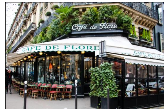
Café de Flore, a café in Paris in the 6th arrondissement

https://roisingrace.com/2015/02/04/exploring-the-6th-arrondissement-paris/