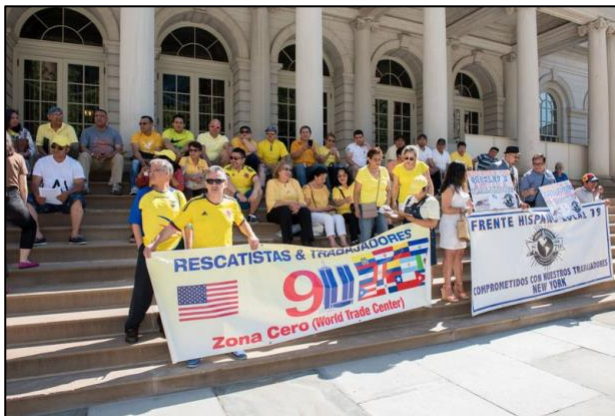
Supporters of undocumented immigrants who helped clean up Ground Zero standing on steps of City Hall in Manhattan. 2017. https://www.nydailynews.com/new-york/manhattan/bill-give-green-cards-immigrants-worked-ground-zero-article-1.3313220

How do we persuade others to enact meaningful change? In this special topics section of Hisp 105, students will improve their speaking skills as they explore issues of sustainability in the Spanish-speaking world. We will reflect about the global consequences of individual actions, debate about the feasibility of ecotourism, and tell the stories of indigenous and Latin American climate activists.