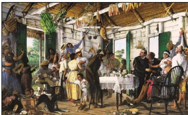
El Velorio , 1893, by Francisco Oller y Cestero

Participants will expand their language skills in Spanish while deepening their understanding of Hispanic cultures. Students will explore how their identity and those of others is expressed through language, images, and cultural practices.