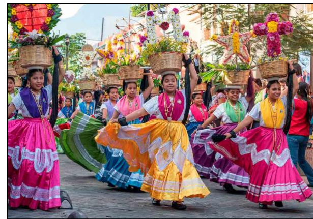
https://www.visitmexico.com/blog/la-guelaguetaza-una-tradicion-magica Guelaguetaza is a traditional Indigenous festival that occurs every year in Oaxaca, Mexico.

Students will actively speak, write, listen, and read in the target language. A variety of media and texts relating to authentic familiar topics will be used. Active participation is essential.