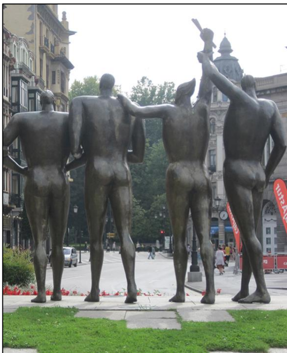
Monumento a la Concordia. Oviedo, Spain. 2011.