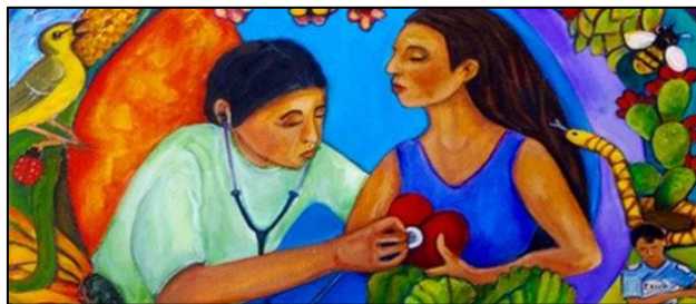
Latino Health Forum, https://www.seamar.org/latinohealthforum/