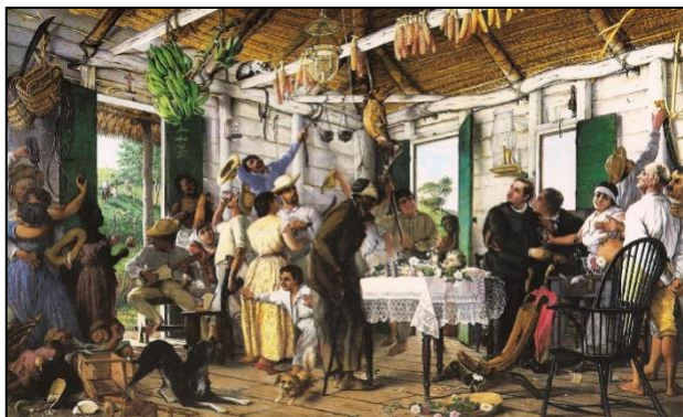
El Velorio , 1893, by Francisco Oller y Cestero

Participants will expand their language skills in Spanish while deepening their understanding of Hispanic cultures. Students will explore how their identity and those of others is expressed through language, images, and cultural practices.