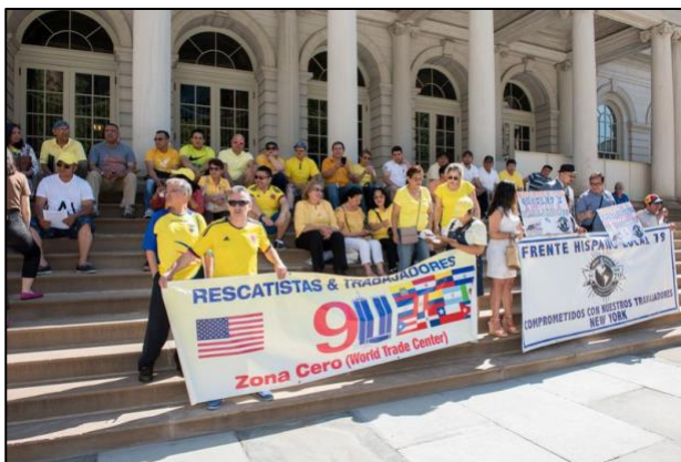
Supporters of undocumented immigrants who helped clean up Ground Zero standing on steps of City Hall in Manhattan. 2017. https://www.nydailynews.com/new-york/manhattan/bill-give-green-cards-immigrants-worked-ground-zero-article-1.3313220

How do we persuade others to enact meaningful change? In this special topics section of Hisp 105, students will improve their speaking skills as they explore issues of sustainability in the Spanish-speaking world. We will reflect about the global consequences of individual actions, debate about the feasibility of ecotourism, and tell the stories of indigenous and Latin American climate activists.