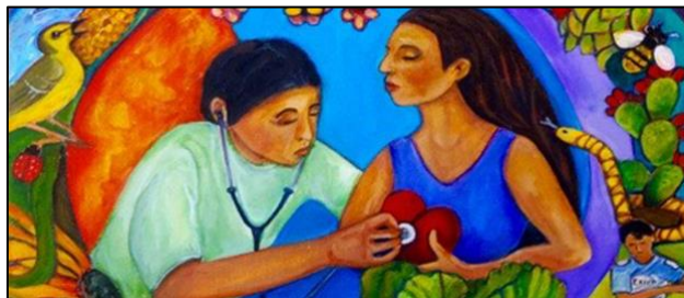
Latino Health Forum, https://www.seamar.org/latinohealthforum/

Prerequisite: HISP 104b or the equivalent. Permission required (please see instructions above). Students will improve their oral communication skills through active participation in practical tasks in contexts related to the way the Spanish-speaking world views the concepts of health and wellbeing. Students will present information, conduct interviews, persuade and debate, among other communicative functions. This course is appropriate for students in any field where they would interact with Spanish speakers regularly.