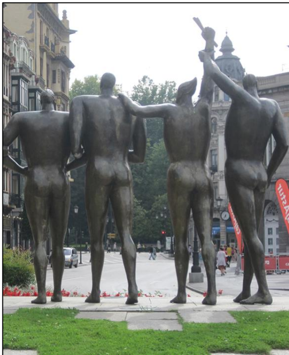
Monumento a la Concordia. Oviedo, Spain. 2011.