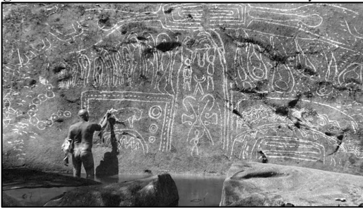
El Abrazo de la Serpiente (2015), dir. by Ciro Guerra

Examines key Latin American texts of different genres (poems, short stories and excerpts from novels, chronicles, comics, screenplays, cyberfiction) and from different time periods from the conquest to modernity. This class places emphasis on problems of cultural definition and identity construction as they are elaborated in literary discourse. Identifying major themes (coloniality and emancipation, modernismo and modernity, indigenismo, hybridity and mestizaje, nationalisms, Pan-Americanism, etc.) we will trace continuities and ruptures throughout Latin American intellectual history.