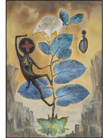
Leonora Carrington (British/Mexican 1917–2011) De la hierba santa

How do we persuade others to enact meaningful change? In this special topics section of HISP 105, students will improve their speaking skills as they explore issues of sustainability in the Spanish-speaking world. We will reflect about the global consequences of individual actions, debate about the feasibility of ecotourism, and tell the stories of indigenous and Latin American climate activists.