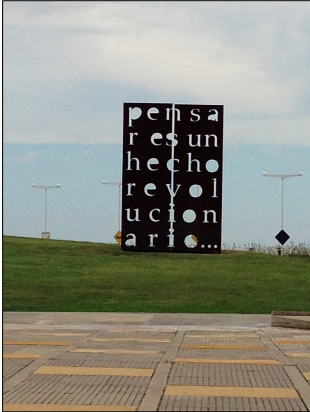
Parque de la memoria. Buenos Aires, Argentina