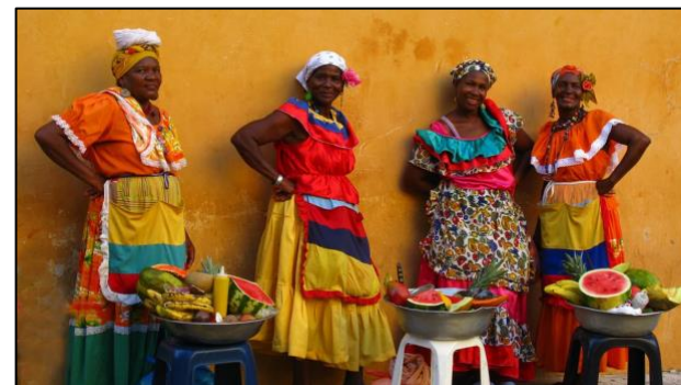
Palenqueras have now become a symbol of Cartagena, Colombia. https://donde.co/cartagena/articles/palenqueras-symbol-cartagena-41129

while deepening their understanding of Hispanic cultures. Students will explore how their identity and those of others is expressed through language, images, and cultural practices.