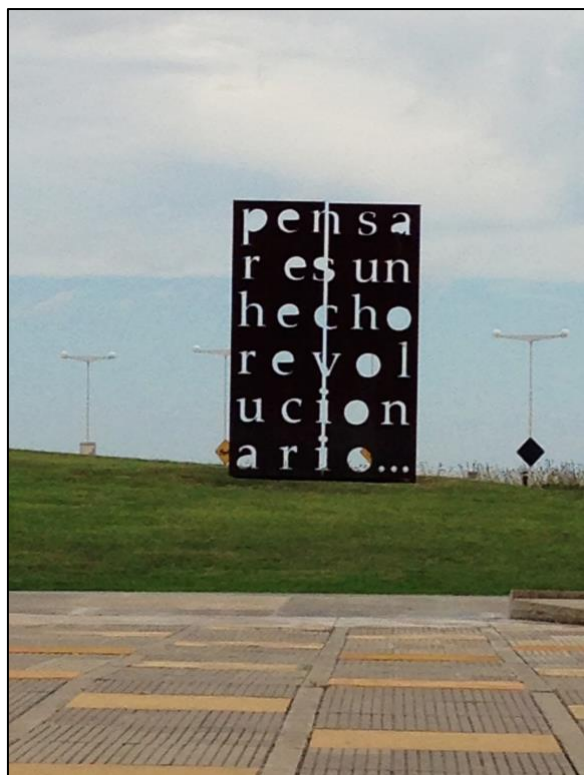
Parque de la memoria. Buenos Aires, Argentina