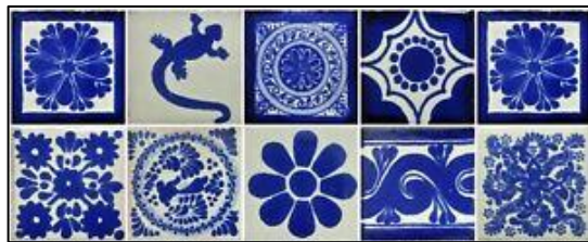
Assorted Mexican Ceramic 4x4 inch Hand Made Tiles

*All courses are conducted in Spanish, unless otherwise noted.*