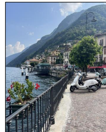
Picture of Italian oceanside

LA SOCIETÀ ITALIANA CONTEMPORANEA ATTRAVERSO GLI OBIETTIVI DI SVILUPPO SOSTENIBILE. Bring your Italian language skills to the next level. You will practice and improve your listening, speaking, reading, and writing skills in Italian, while learning how Italian society is changing. In this course we'll address issues related to globalization, the environment, and social justice in contemporary Italy and see how music, art, and social activism represent and create change.