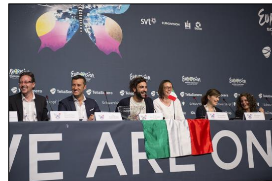
Marco Mengoni at a press conference during the Eurovision Song Contest, Malmö.

Italian experience worthwhile. Just as in Italy, if you have no specific reasons to study Italian, we will make one up just for you!