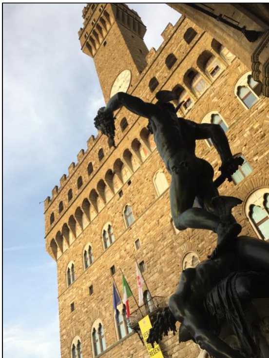
Piazza della Signoria, Florence, Italy