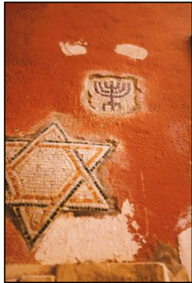
2018. Metropolitan City of Rome, Italy.

Conducted in Italian. [WI, Cross-listed with ECS, MERS, & NEJS] Analyzes Italian Jewish representations in Italian culture from medieval times to the founding of the ghetto in Venice in 1516 and leading Jewish figures of the Renaissance. Works of modern Italian Jewish writers and historians are examined as well as Italian movies that address Jewish themes within the mainstream of Italian culture. This course has an interdisciplinary approach while focusing on advanced Italian language skills.