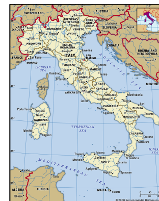
Map of Italy.

Is Italian synonymous with pizza and the Mafia? Of course not! Students in this course advance their study in Italian language and culture by improving their ability to recount events, give descriptions, and make comparisons—both orally and in writing. Working with newspaper articles, short stories, and films, students gain an understanding of what growing up in Italy is all about! Students learn how the closeness of family and friends is the basis of Italian culture and how Italians are able to live in a modern Italy despite their old soul that comes from ancient values and colorful imagery of its people.