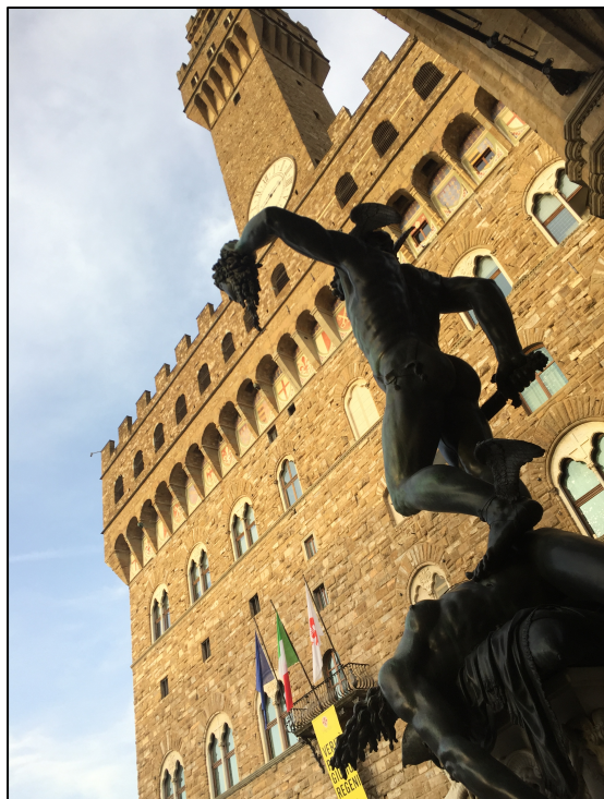
Piazza della Signoria, Florence, Italy