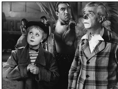
'La Strada', 1954, dir. Federico Fellini

Italian Americans? How is migration to Italy and Europe reshaping the culture of "otherness" and addressing diversity? How are black writers and activists contributing to a new Italian identity? In this course, we will try to map the complexity of key historical and socio-political moments through the lens of key Italians' actions, literature, music, and cinema.