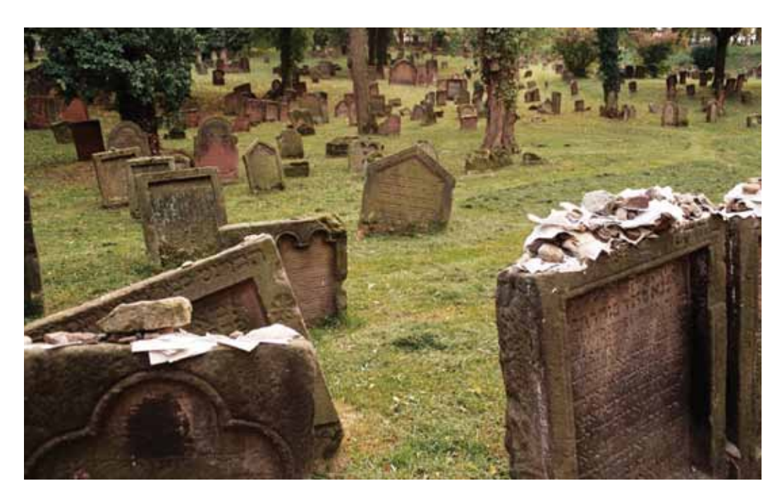
The Jewish Cemetery in Worms, or "Heiliger Sand," possibly the oldest surviving Jewish cemetery in Europe. The oldest legible tombstone dates from 1076, the last, 1940.

who survived the Holocaust (out of a community of more than two thousand), very few came back to live there after the war. The story of postwar Worms Jewry therefore has more to do with relics than with people. The moveable ones—what survived of the community's archives, manuscripts, and ritual objects—eventually came into the hands of the Israeli government, thanks to the intervention of Chancellor Konrad Adenauer. It was Adenauer, too, and other German officials who were mainly responsible for pushing ahead with the plans to rebuild the Worms synagogue, despite the reservations or opposition of