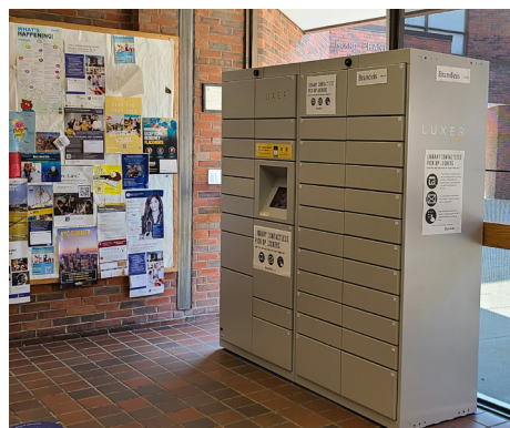
New pick-up lockers were installed in Usdan in fall 2020. There were 82 deliveries and 53 unique users.