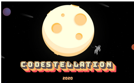
Codestellation 2020 graphic.