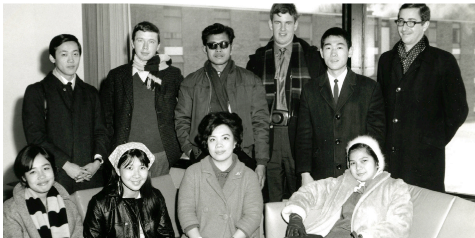
Photo of Asian Student Group in 1968 from the AAPI Timeline on the Black Space Portal.