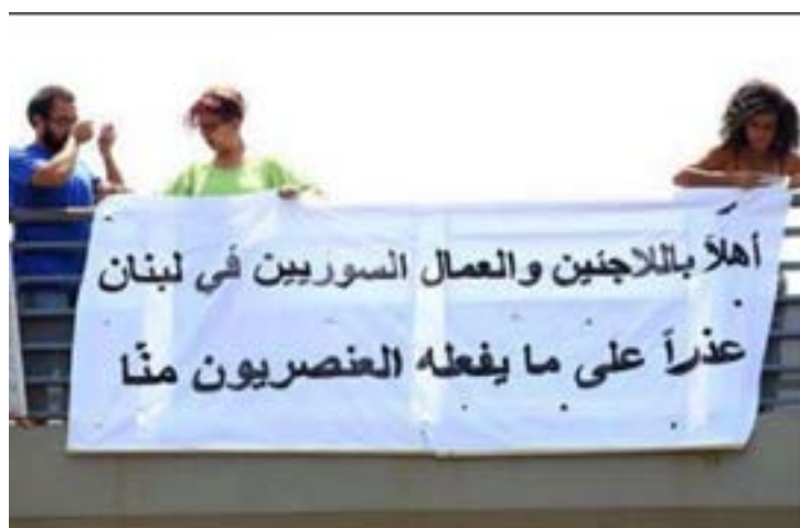
Image 2: Posted and shared by several social media activists on Facebook and Twitter

Many social media activists took to their channels to recirculate the following message (see Image 2): “Welcome to Syrian refugees and workers in Lebanon. We are sorry for what the racists among us commit.” Likewise, some bloggers and social media activists volunteer in different UNHCR drives for clothing, food, and other essential supplies and often coordinate fundraising campaigns in some of Lebanon’s most impoverished communities, for underprivileged Lebanese as well as Syrian refugees.